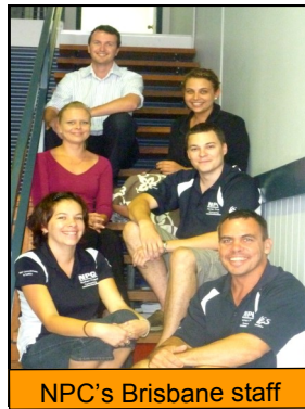
NPC's Brisbane staff

As part of the girls traineeship they're also doing a work placement at Townsville Aboriginal and Islander Health. NPC are proud to be able to partner with such a great organisation to help the girls achieve their goals.