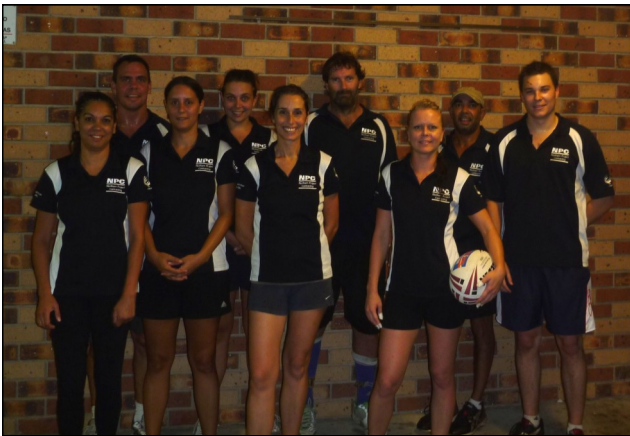
NPC's scorching touch football team climbing the ladder