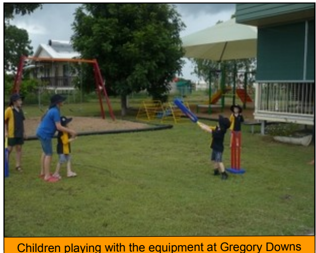
Children playing with the equipment at Gregory Downs

Gregory Downs School is a branch of Doomadgee State School, it is located 45 minutes east of Century mine with five students.