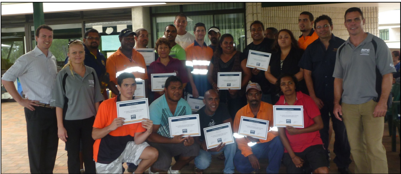
Graduates from the Civil Construction course with NPC staff and mentors

The course delivers a Certificate 1 and six units toward a Certificate 2 in Civil Construction as well as life and job skills to make sure people develop with careers. (cont. page 2)